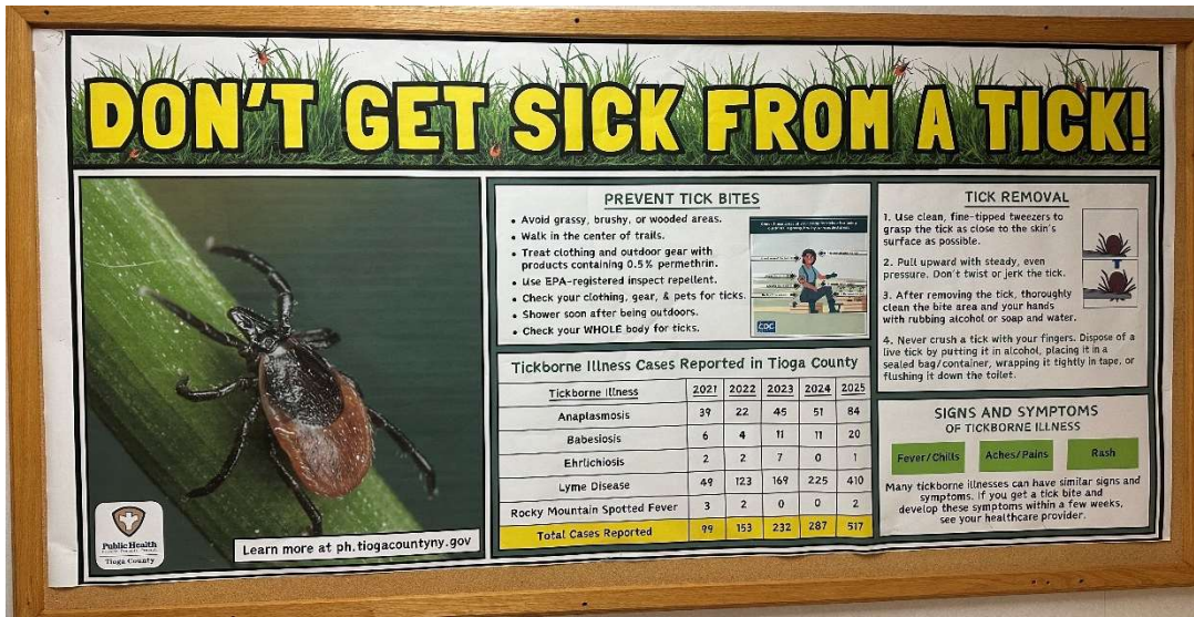
Bulletin Board: Health & Human Services Building, Owego, NY, April 2026.