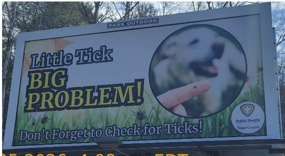
Billboard: Various Locations, April 2026