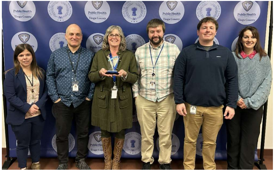
Public Health Excellence Awards: Public Health Protection Award, Tioga County Public Health Environmental Health team