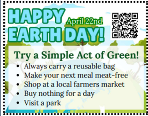
Flyer: "What the Health!?" April 2026.