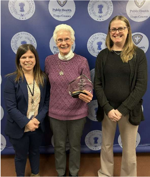
Public Health Excellence Awards: Public Health Champion Award, Tioga County Rural Ministry